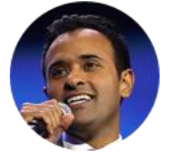
**DOGE Co-Chair Vivek Ramaswamy