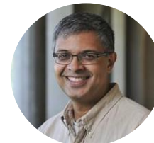
NIH Director Jay Bhattacharya, MD