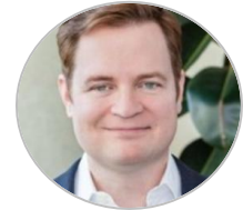
Deputy Secretary Jim O'Neill