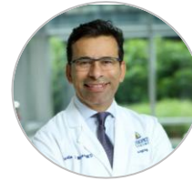
FDA Commissioner Marty Makary, MD