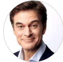
Administrator Nominee Dr. Mehmet Oz