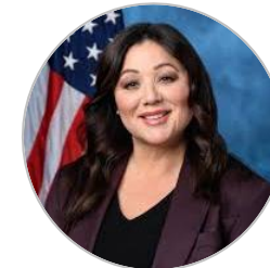
U.S. Department of Labor Secretary Nominee Lori Chavez-DeRemer