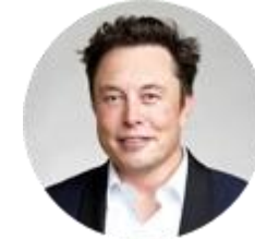
DOGE Co-Chair Elon Musk