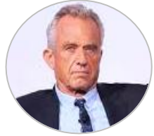
Secretary Nominee Robert F. Kennedy Jr.